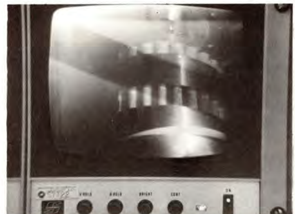
...Chamber piston as seen on screen in Control Room...