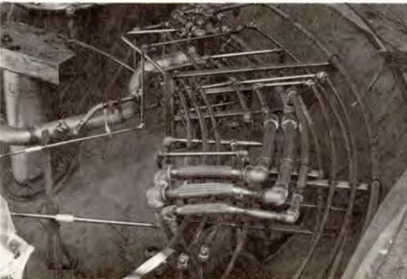
...June, 1972, internal piping...