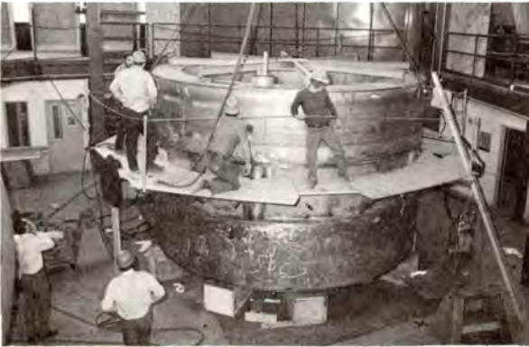
...March, 1972, the superconducting magnet...