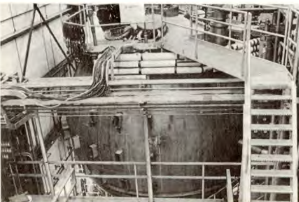
...September 29, 1973, in operation...

complex and painstaking assembly and testing of the 15-Foot Chamber.