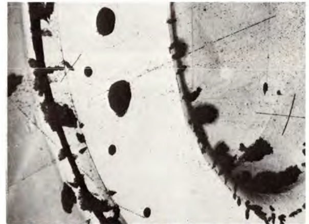
...First tracks in NAL 15-Foot Bubble Chamber...