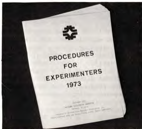
...1973 edition of Procedures now available...

Those who want to do research at the National Accelerator Laboratory prepare a research "proposal," a comprehensive statement of the physics to be covered in the experiment, the facilities and equipment needed, how the experiment is to be funded, and the collaborative efforts involved. Proposals are evaluated by the NAL Program Advisory Committee, a distinguished group of twelve high energy physicists. A recommendation on each proposal is made to NAL's Director by this committee. Proposals may be approved or disapproved; they may be combined with similar proposals, or approval may be delayed until the outcome of other experiments becomes known. Approval means that the experiment has scientific interest and is technically feasible.