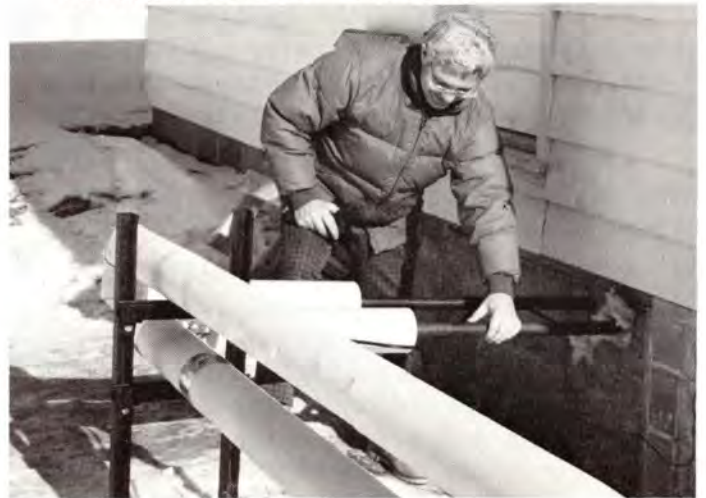
...Heat in water from solar collector panels enters heating system of house...