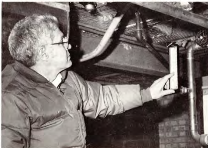
...120° water temperature reached in first test...