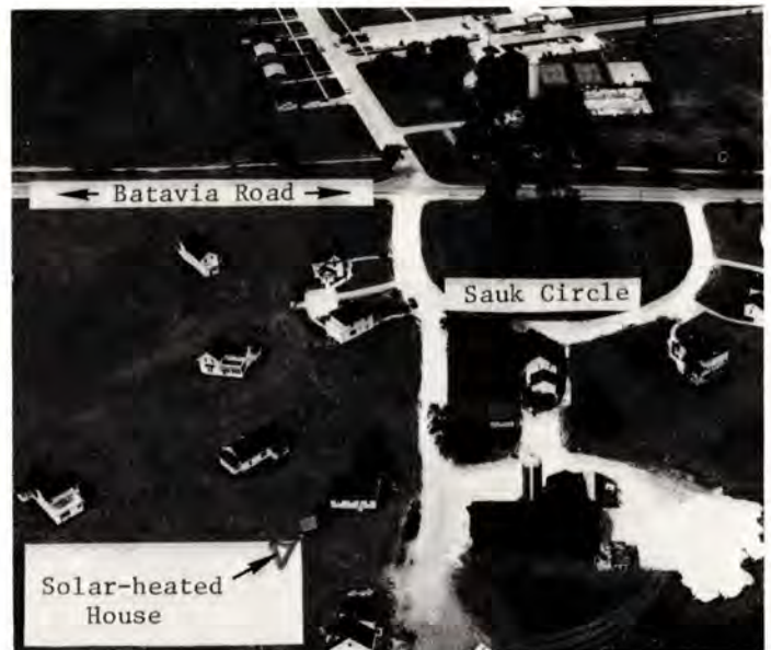
...Solar Energy House at Fermilab on Sauk Circle...