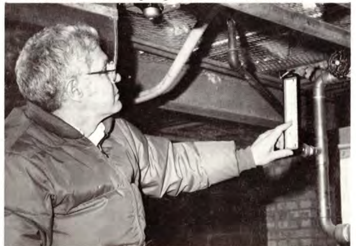
...120° water temperature reached in first test...