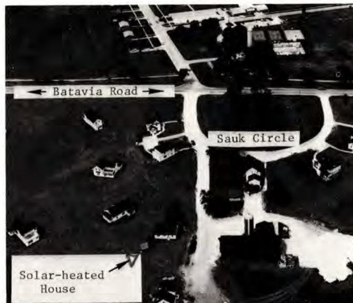
...Solar Energy House at Fermilab on Sauk Circle...