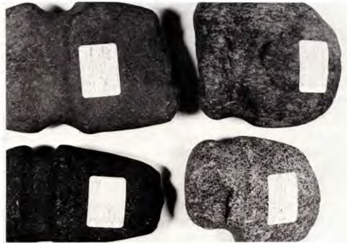
...Some of the stone tools of prehistoric people found on the Fermilab site by August Mier over the past sixty years...

1976 is a year of looking back. The Village Crier looks back to 1972 when August Mier of Batavia brought his unique collection of over 900 pre-historic artifacts to the Laboratory. Included were some of the tools used by people inhabiting the land of Fermilab over the past 8,000 years. Mr. Mier picked up these artifacts during sixty years of walking the grounds which are now part of the world's largest particle accelerator.