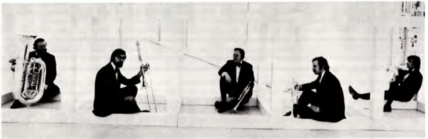
...Chicago Brass Quintet...

Five of the best brass players in the Chicago area -- the Chicago Brass Quintet -- will perform in concert at the Fermilab Auditorium on Saturday, April 3rd at 8:30 p.m.