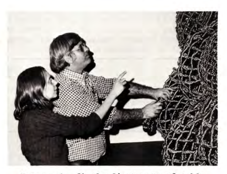
...Kanes make final adjustments of cable sculpture