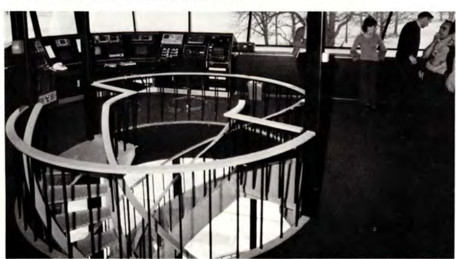
... Two interlaced spiral staircases lead up to control center...