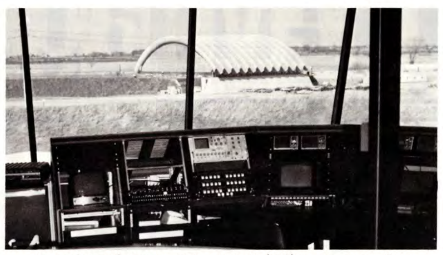
... New view of Meson Detector Building as seen from the Pagoda...