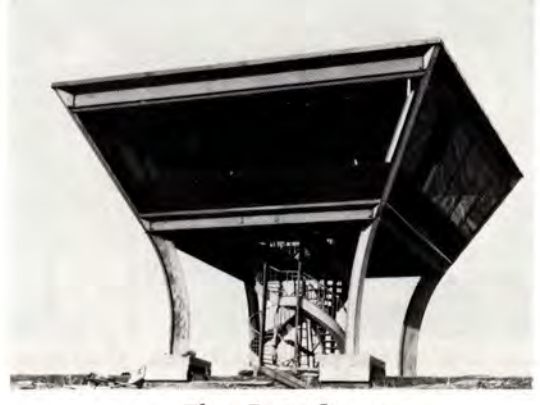
... The Pagoda ...

The Pagoda is glassed on four sides and rises some 30 feet from the ground, making it the best place from which to see the entire outlying experimental areas. From the vantage point of the control deck of the Pagoda a 360° view is possible. But the three experimental halls controlled from the Pagoda -- P-East, P-Center, and P-West -- lie buried deep underground.