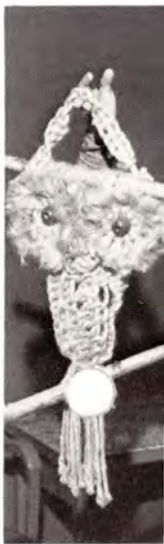
...Sue Po Facili