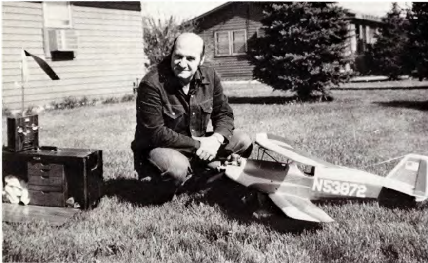
...Tony Frelo (photography) - model airplanes...