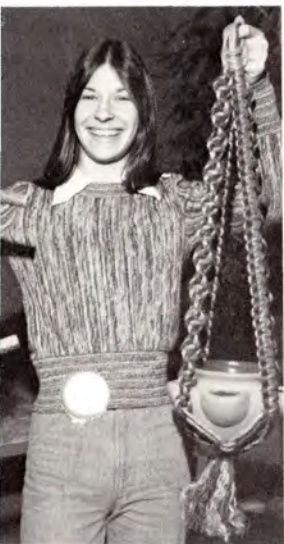
...Bill (Scanning ...ty) - macramé...