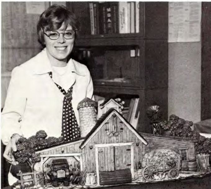
...Marilyn Kasules (Safety) ceramic wall piece...