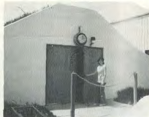
...Barb Perington, Int. Target Section, at entrance of protomain, one of 3 tornado shelter areas in the NAL Village...

At the shelter, report to the building warden stationed there; be sure to tell him if/when you leave. If there are no instructions for your area, or if you are confused about what you should do, contact your Section Head or the NAL Safety Office, Ext. 580.