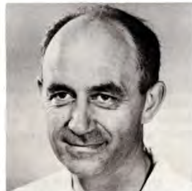
Enrico Fermi, 1901-1954