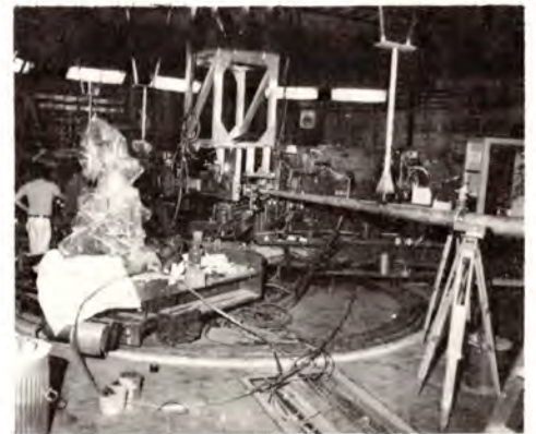
...Pivot point shared by E-95 and E-284 in the P-West pit...