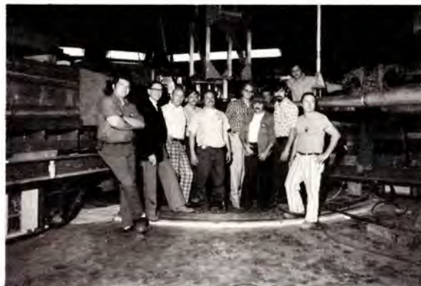
...Proton Department Personnel standing between the E-95 spectrometer arms...

Experiment #177 (Cornell University-McGill University-Northeastern University, and