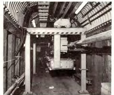
...E-177 Septum Magnet...