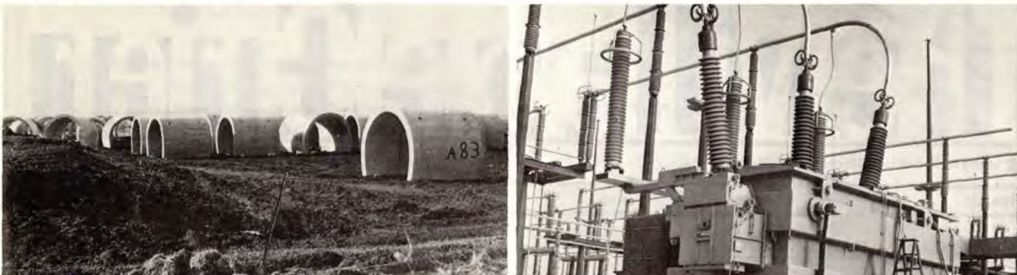
...Main Ring and Master Substation, two of DUSAF's many challenges in six years at FermiLab...