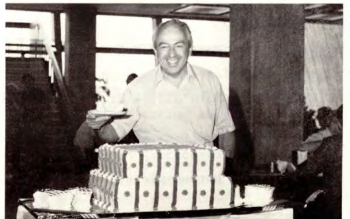
...Happy Birthday to US...