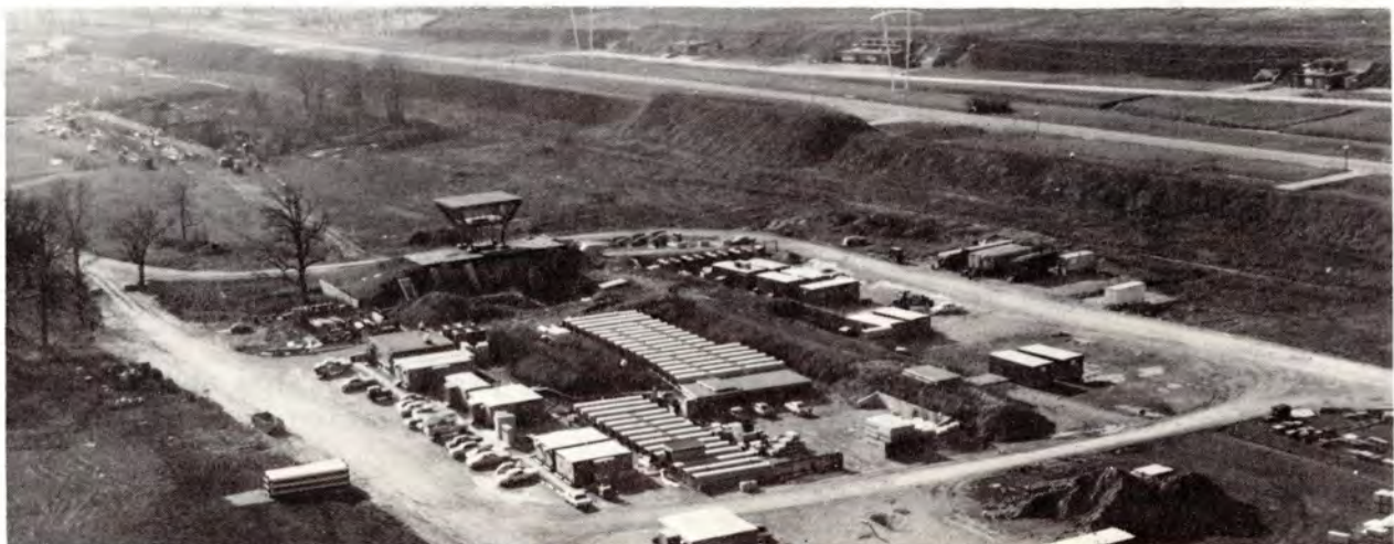
...The Proton Area...