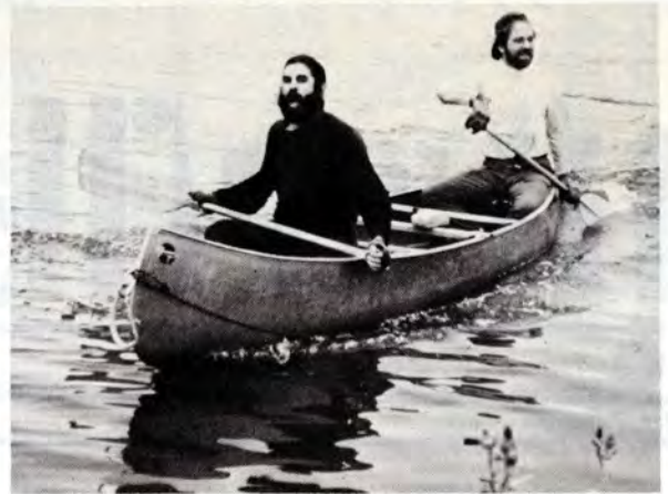
...Prentice-Luste team in last year's Accelerator Canoe Race...