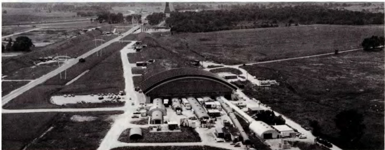
...The Meson Area...