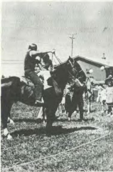
The Riding Club responded to the anticipated requests for a "horseback ride" and brought five horses to the Village for the enjoyment of the children. Club members took many young visitors around the improvised ring during the afternoon....