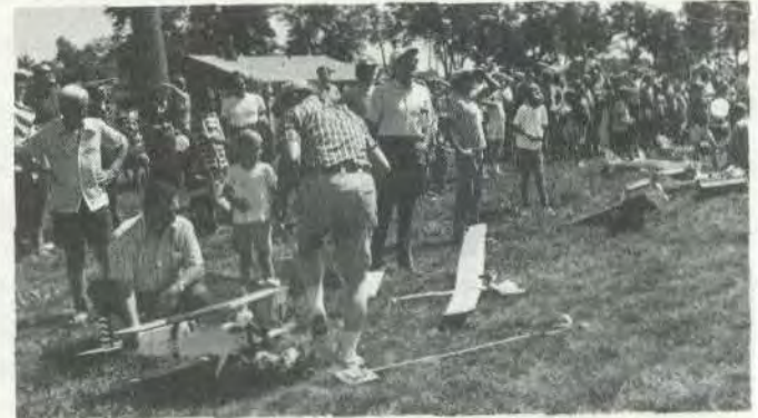
Arranged by Tony Frelø of the NAL Photo Unit, the demonstration included more than 35 models of expert craftsmanship. The aerial antics of the remotely-controlled flying machines brought squeals of delight from the onlookers all afternoon....