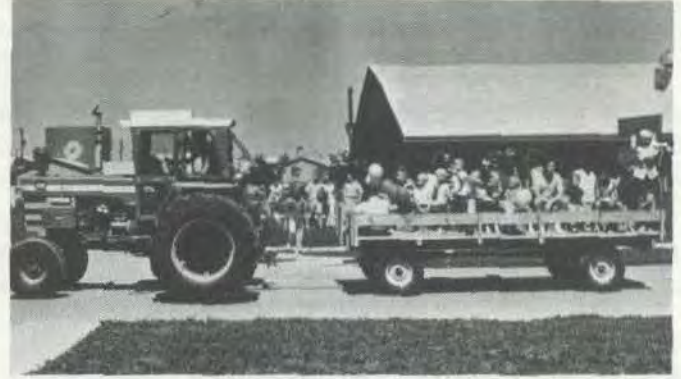
Tractor-haywagon rides were provided by Farm Management, as well as fire engine rides by the Fire Department. More than 1,200 children of all ages rode during the afternoon....