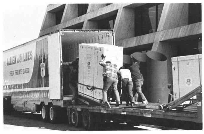
...Movers unload one of two new Fermilab computers from van...