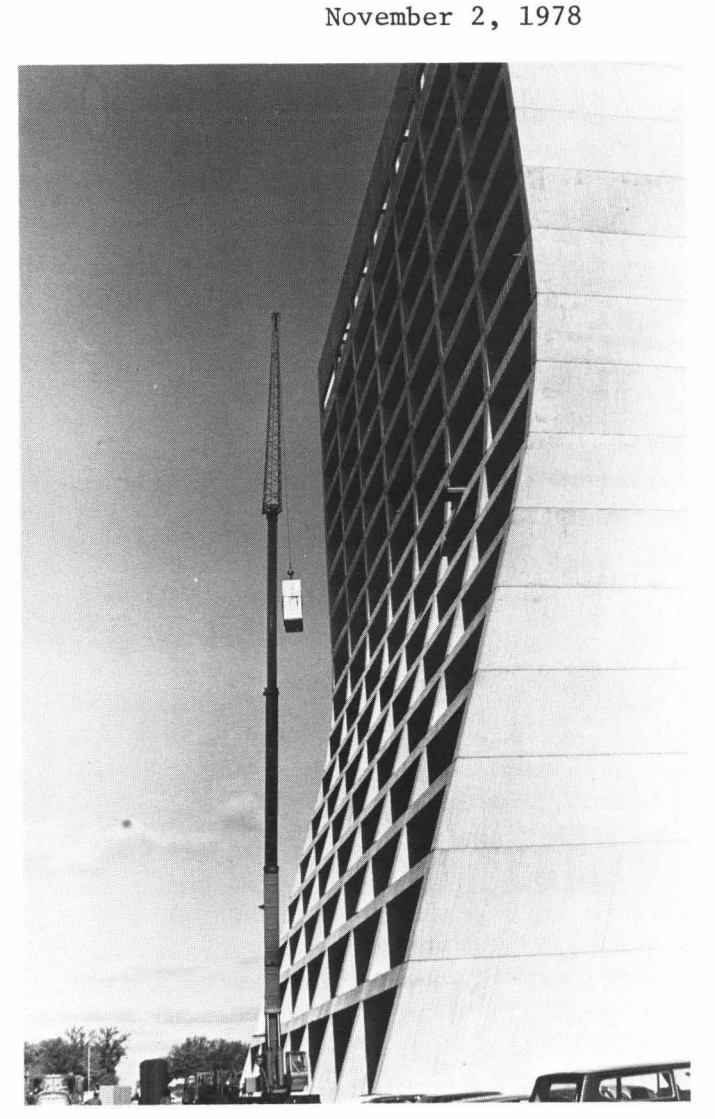
... Crane lifts computer to CL-8W...