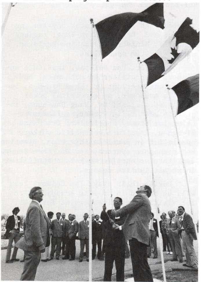
...Peoples Republic of China flag joins Central Laboratory gallery of flags...