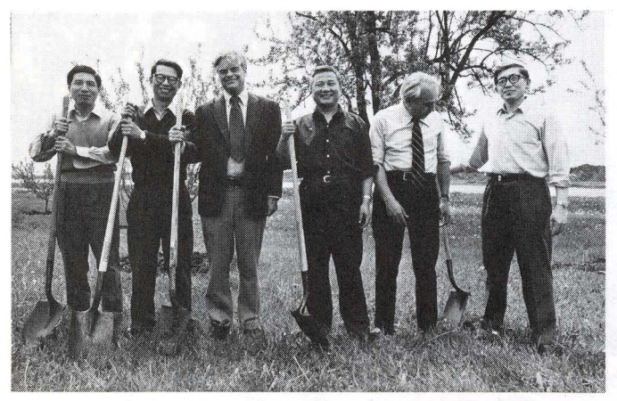
...On Arbor Day Chinese visitors helped Fermilab employees plant trees...

Two groups of Chinese scientists visited Fermilab previously. In December, 1972, a delegation spent a day at Fermilab during an international tour; a second group spent three days at Fermilab in June, 1973, on a five-week tour of major U.S. high energy physics facilities.