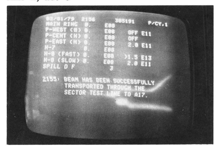
... Monitor in control room announces successful conclusion of sector run...