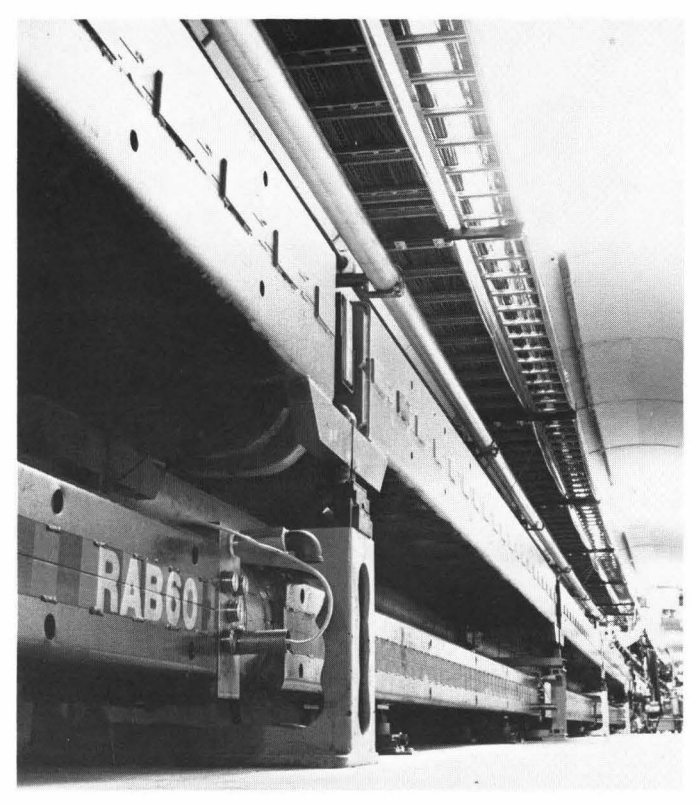
... The 25 superconducting magnets extend for 500 feet below the main accelerator magnets...