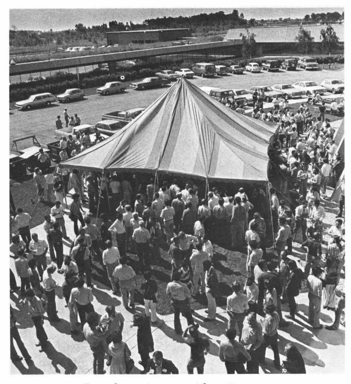
... Refreshments on the Terrace...