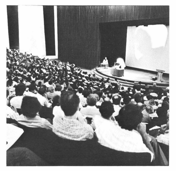
(More photographs on page 2)