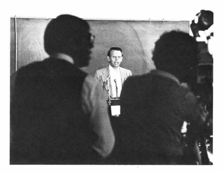
... Herwig Schopper, director general of DESY , addresses the media at a press conference about gluons...