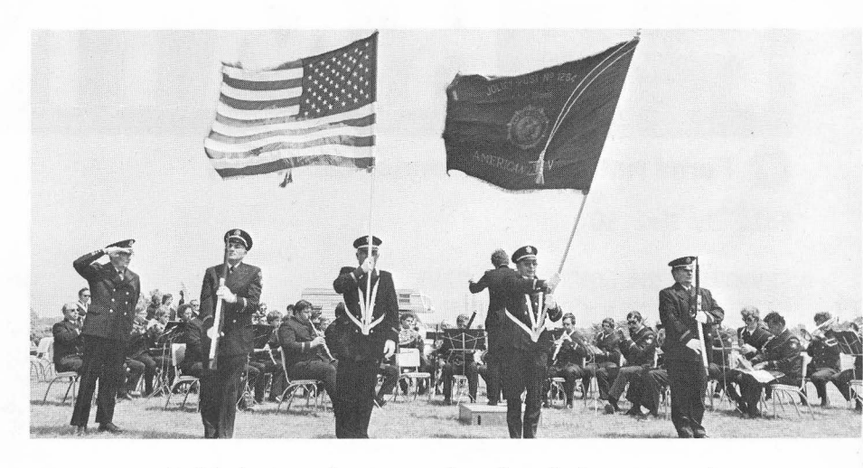
Joliet American Legion band in concert