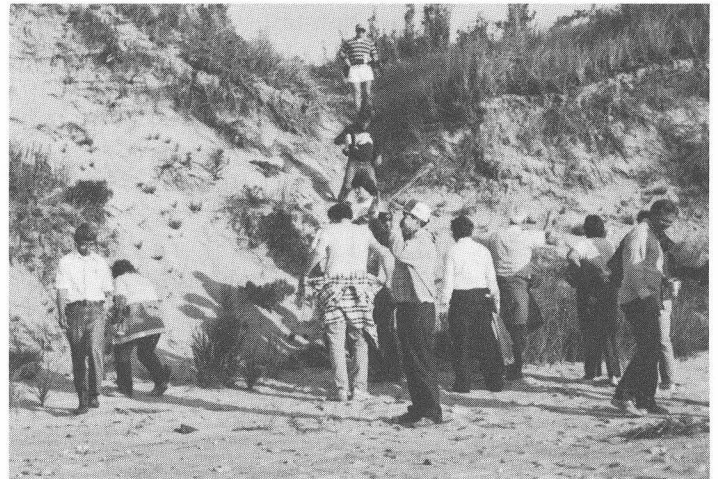
SIST teachers and staff explore the Michigan dunes.

The Forest Beach Camp, the Indiana Dunes and Stevensville Bog hikes, our Mudlake Bog hike, and the new insights and knowledge we gained along the way made this year's SIST field trip an unforgettable, and educational, experience which will be shared by the teachers with their students during the coming school year. We expect that many will take their classes for a trip to the camp for a firsthand glimpse of the natural wonders which we saw.