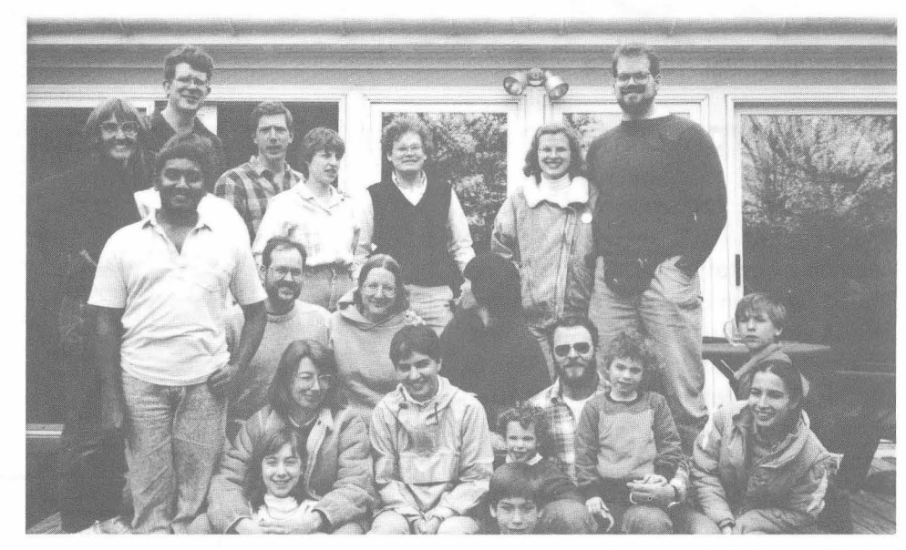
Armed with garbage bags, wheel barrows and a dump truck provided by the Fox Valley park district, families from E769/E791 and the Computing Division's Online Support Group spent a Saturday policing a portion of the Illinois Prairie Path. Most of the group are frequent users of the path, and for some, it is even a means to get to and from work at Fermilab.

The Prairie Path is actually a group of trails running from the towns of Aurora, Geneva, Batavia and Elgin west through Wheaton towards Chicago.(See map on page 3. Additional maps are available in the Public Information Office, WH1W.) The trail currently ends around the Tri-State Tollway, although additional expansions are planned. The surface of the trail is compacted gravel or asphalt, an easy surface for any biker or hiker. It is linked to the Fox Valley River Trail in several spots and runs through the central parks in several of the connected towns.—Tom Carter