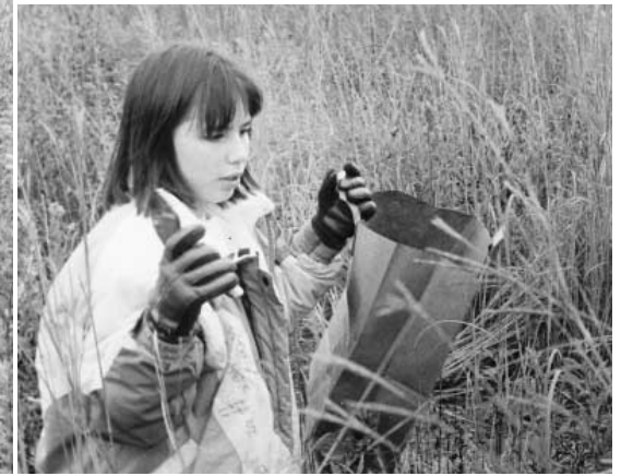
Girl scouts from Ashton, IL made the trip to Fermilab to visit the native grasslands.

Text by Donald Sena, Office of Public Affairs