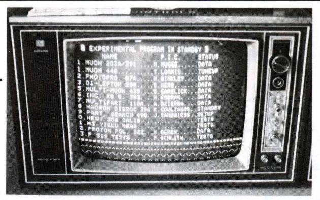
...Accelerator status Tuesday: still on standby...

At Village Crier presstime Tuesday, emergency energy conservation measures instituted last week remained in effect at Fermilab. The main accelerator continued on standby status under a Feb. 22 Department of Energy directive prohibiting a startup. As a result, high energy physics studies stopped. Also, lighting levels reduced Feb. 24 were still at 40 percent. The measures are part of DOE's plan to conserve energy until the coal strike is settled.