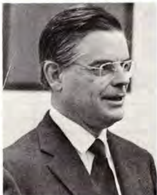
Robert R. Wilson

Robert R. Wilson , Director of the National Accelerator Laboratory, was awarded the National Medal of Science, the federal government's highest award for distinguished achievement in science, mathematics and engineering, at a ceremony at the White House on Wednesday, October 10. The announcement of the award by the President on October 3 cited Dr. Wilson for his "unusual ingenuity in designing experiments to explore the fundamental particles of matter and in designing and constructing the machines to produce the particles, culminating in the world's most powerful particle accelerator."