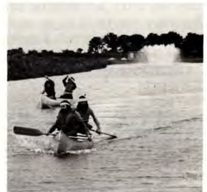
...Coming in close at the finish line...