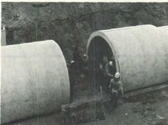
....Corbetta Construction Co. workmen prepare to spread grout to bind final pre-cast enclosure in NAL's Main Ring....

The Main Ring Enclosure consists of 1,790 pre-cast concrete sections. Each section is nine feet high, 10 feet wide, 10 feet long and 10 inches thick. The sections are placed on a poured concrete slab approximately 20 feet below ground. Special vehicles are planned for moving equipment and personnel.