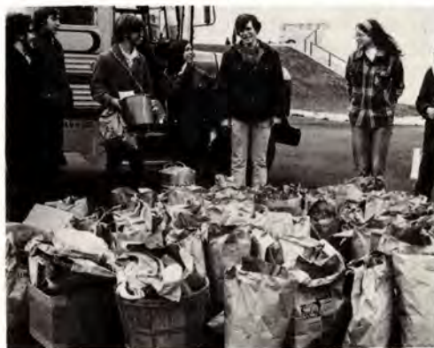
...Bringing home the harvest...