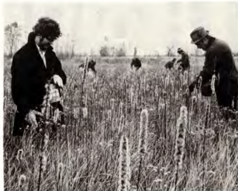
...Volunteers harvesting prairie seeds last October at Markham...