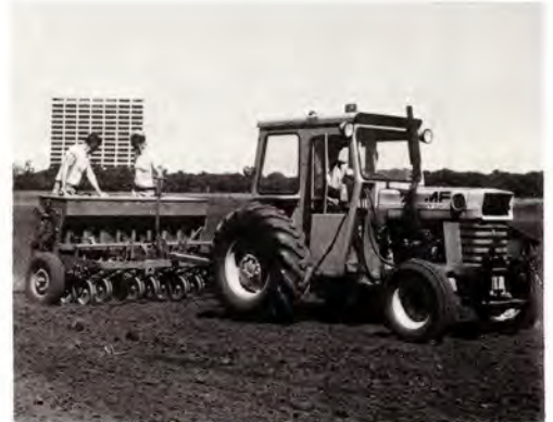
...Planting in center of Main Accelerator...

To the uninitiated, "prairie" is the name attributed to grassy, treeless fields, generally associated with the flat open spaces of Midwestern United States from Ohio to Kansas. "Prairie," (from the French, meaning "meadow") is actually the descriptive name given by the Europeans who