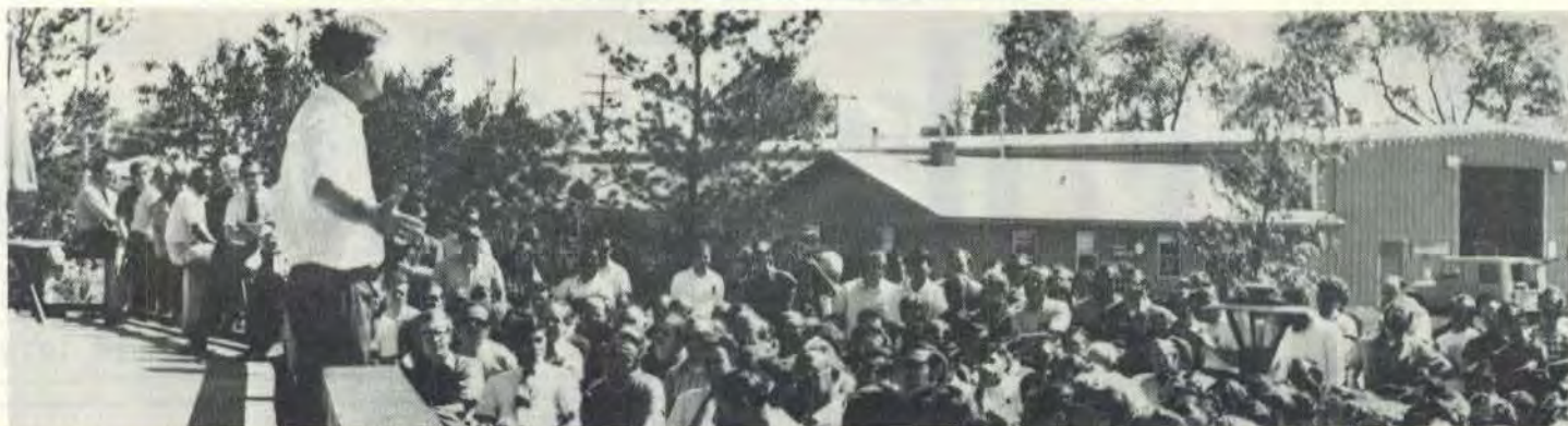
...NAL employees gathered outside the Curia on Thursday, June 15 for Directors' meeting...