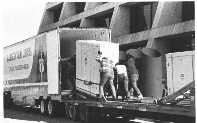
...Movers unload one of two new Fermilab computers from van...