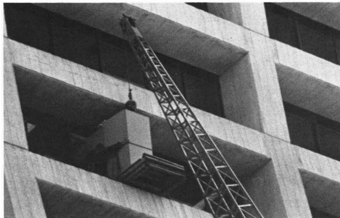
...Workman guides computer through Central Laboratory window...