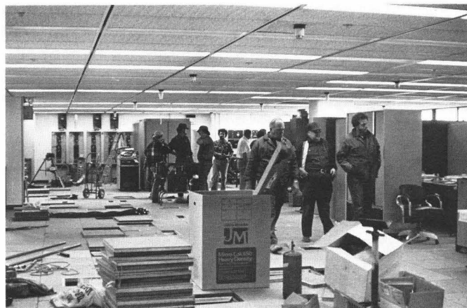
...Eighth floor computer room undergoing remodeling...

of assistants launched the upgrade by inviting proposals from computer vendors.