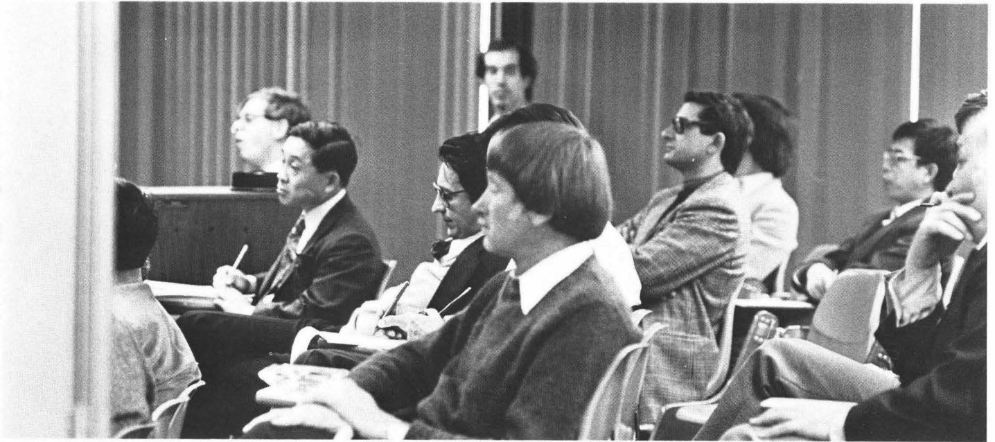
...Physicists worldwide gathered in Fermilab's Curia II for "Big Accelerator" planning meetings....