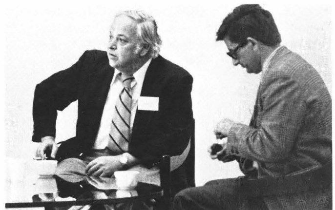
...B. Richter (L) of SLAC and J. Augustin, U of Paris, between conference sessions..