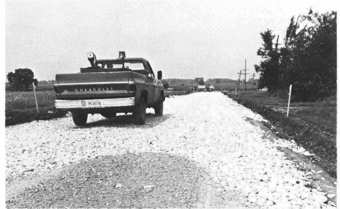
...Batavia Road under repair....

yards; and Batavia Road, from Wilson Street intersection, 746 square yards.