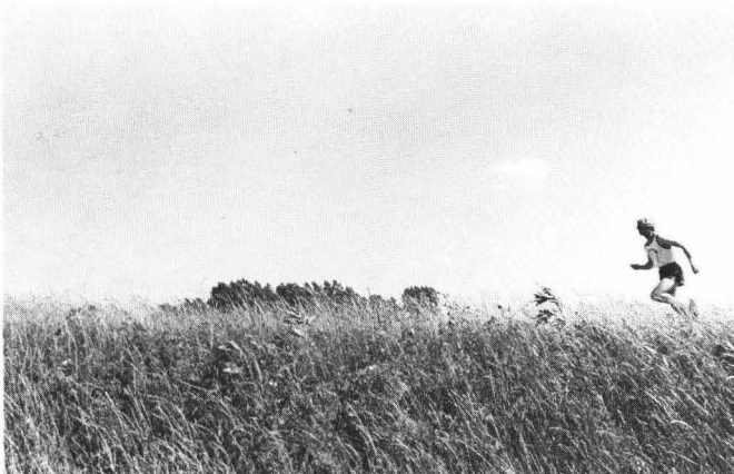
...Sign of Spring...