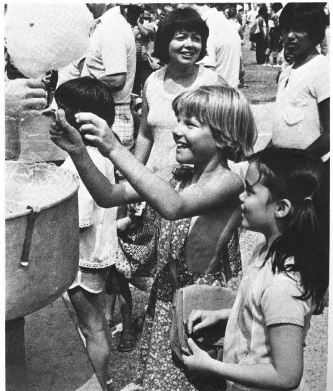
...An anxious moment away...