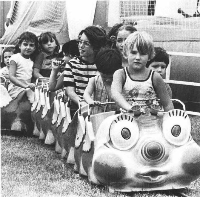
...Dandy duty for a centipede...

One of the largest crowds ever, she said.