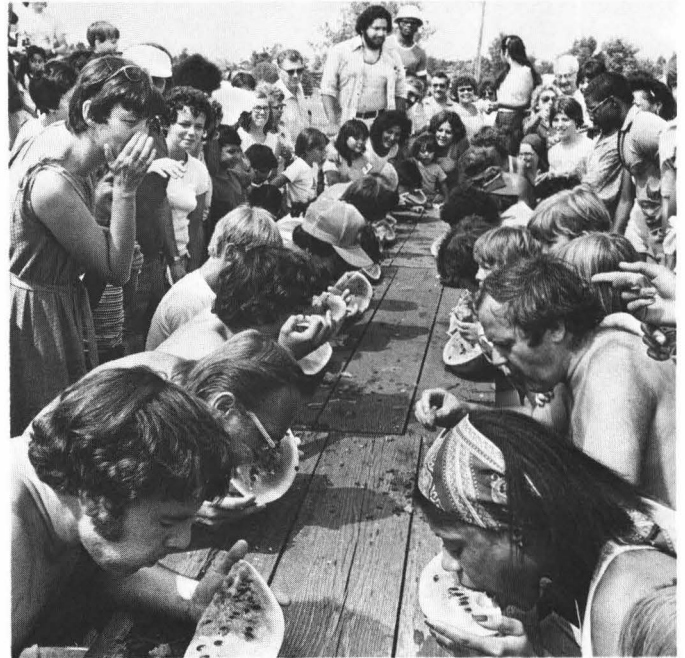
...Watermelon eating contest...