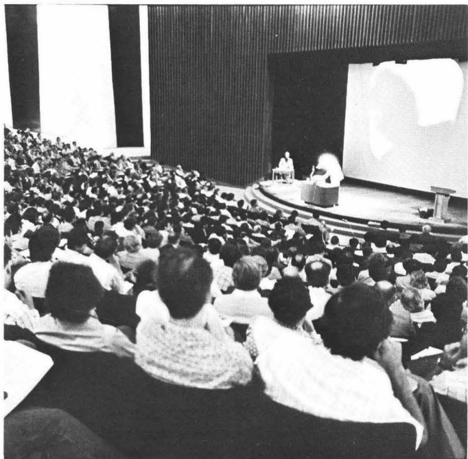
...A full house...