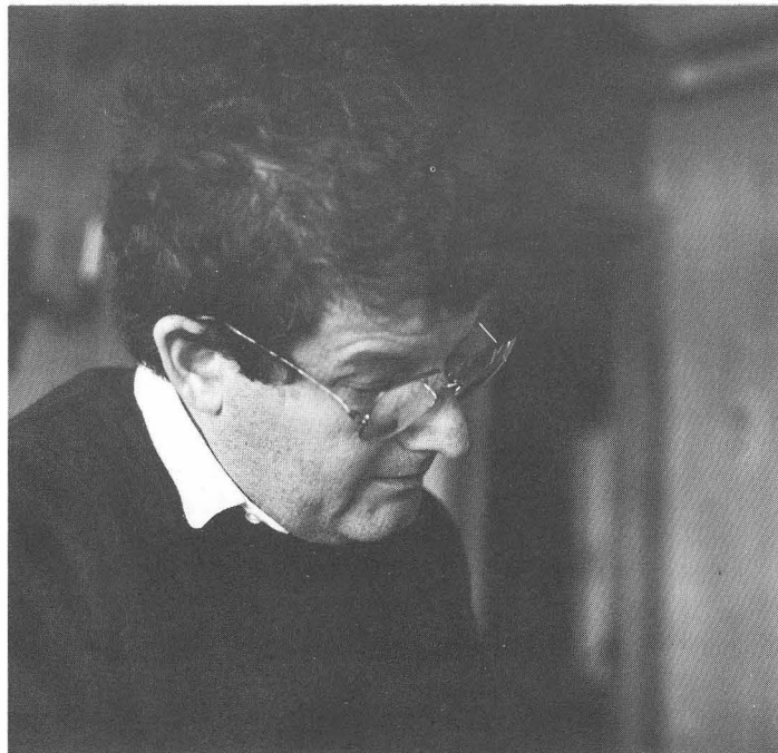
Architect Stanley Tigerman

Tigerman's talk, "The House We Live In: Modern Versus Post-Modern Architecture," will focus on the design of post-modern architecture and the significance of changing architectural styles. "Architecture today," says Tigerman, "should reflect life as it is and move away from synthesis to a sort of thesis-antithesis."