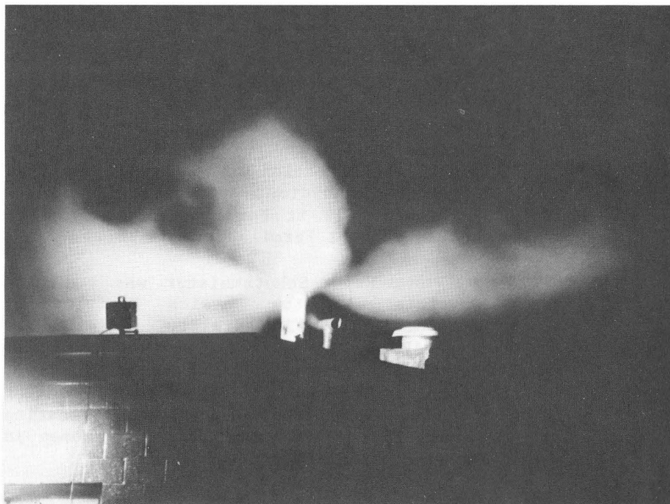
Helium gas escaping as a result of a quench at service building A1.