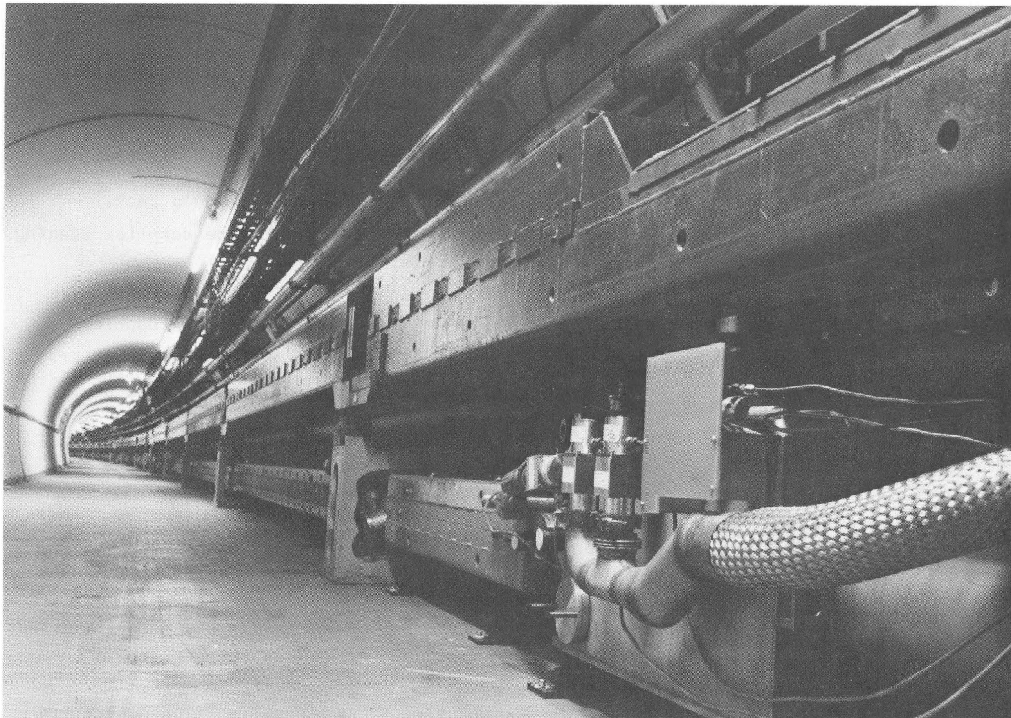
View along the tunnel. The Main-Ring magnets are above the superconducting magnets.