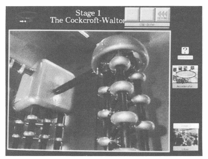
Screen from a prototype introducing accelerators

Building Liz's programs is much more complicated than using them. "The technology is changing so fast," Liz said. "You really have to learn to work with the hardware." Three computer Continued on page 7.