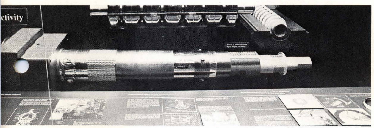
...Prototype of superconducting magnet donated by Fermilab...