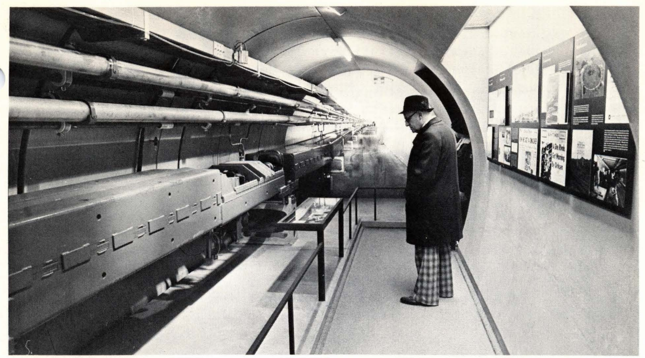
... Visitor views facsimile of Main Ring tunnel section at Smithsonian...