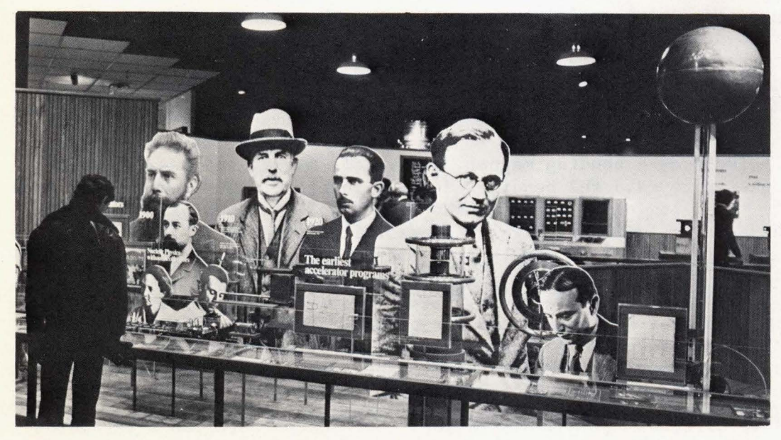
... Accelerator pioneers are portrayed in a display chronicling early physics research programs...