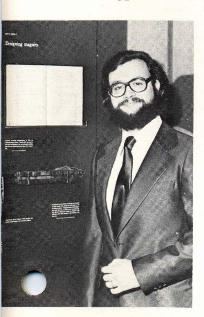
Energy Doubler/Saver cal analog of strong nibit...